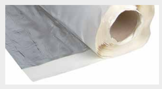
KÖSTER KSK ALU 15